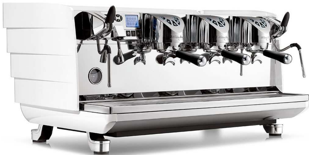
Pearl White Machine (Available in public price list)